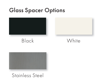
Black glass spacer shown