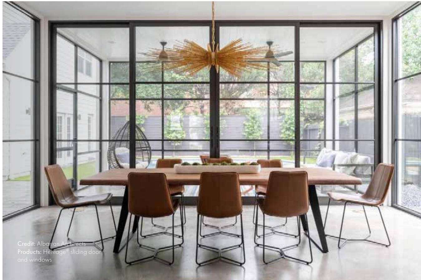
Credit: Albarran Architects Products: Heritage® sliding door and windows