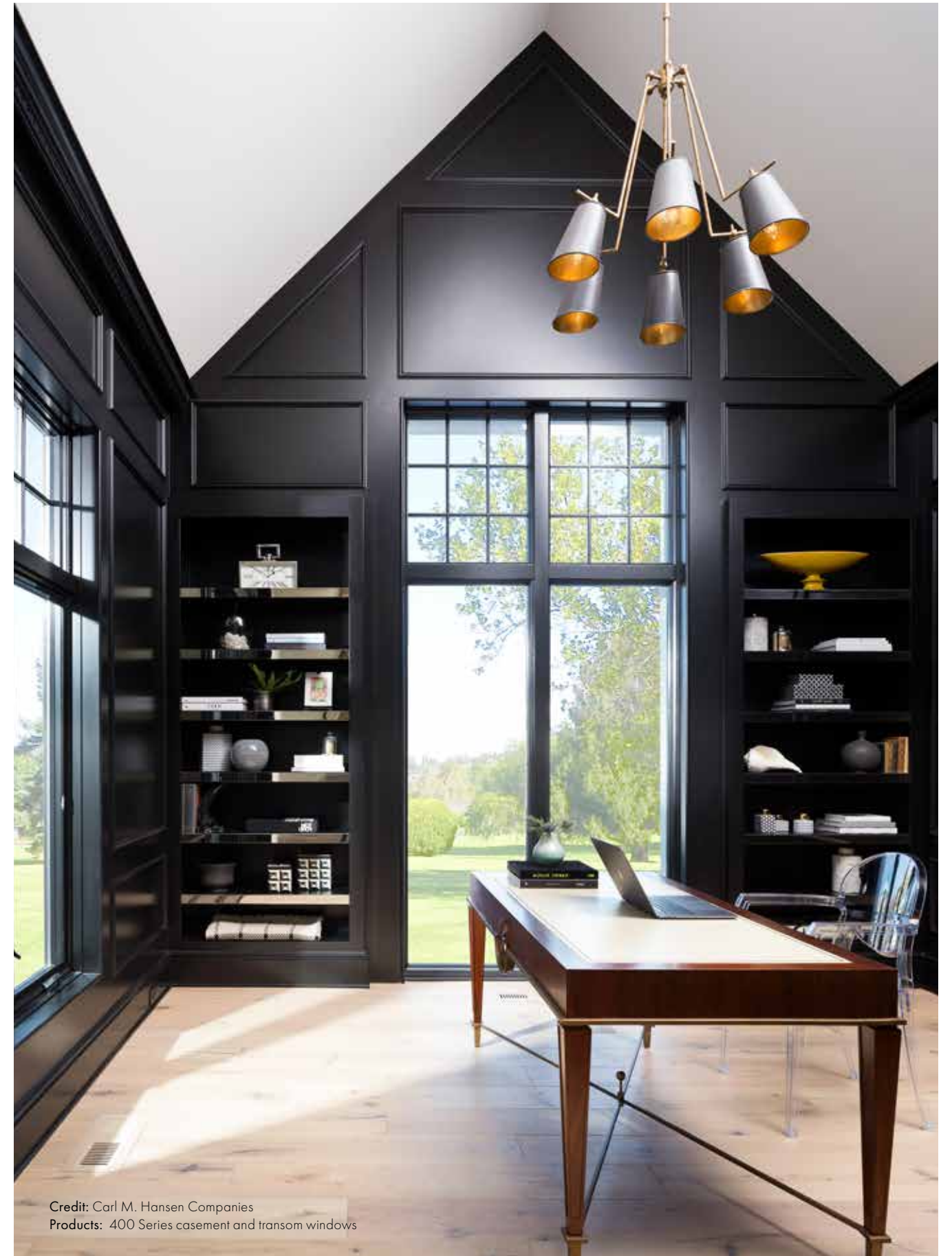
Products: 400 Series casement and transom windows