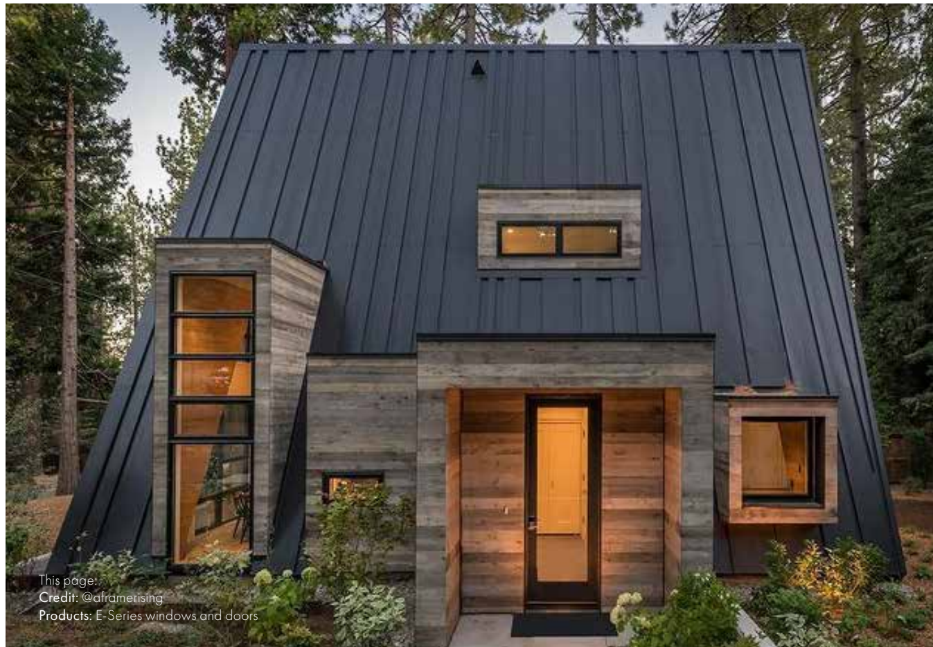
This page: Products: E-Series windows and doors