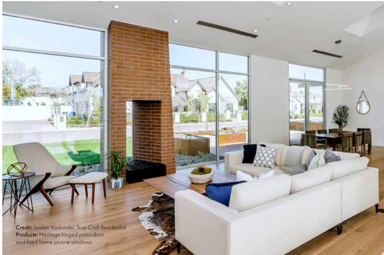
Credit: Jordan Vasbinder, True Craft Residential Products: Heritage hinged patio door and fixed frame picture windows