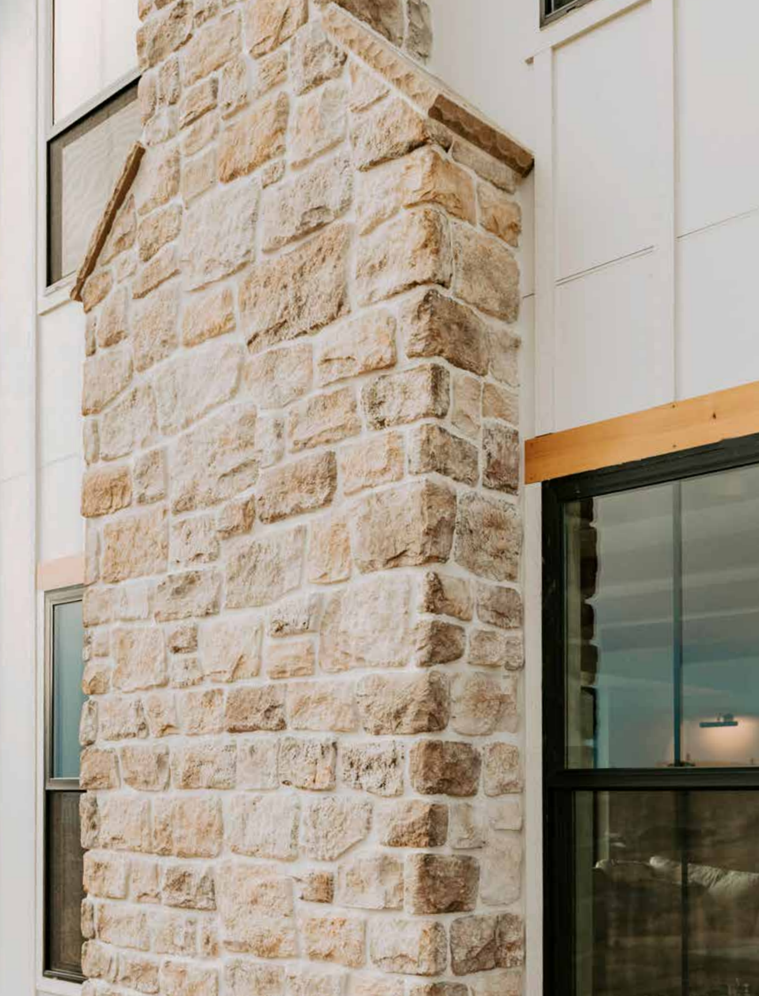
This page and opposite: Credit: @petitemodernlife Products: 100 Series windows